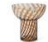
Art.Nr.: PGMSB Ø5,5cm I10,5cm