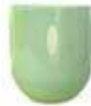
Art.Nr.: EVMGG ~ Ø18cm ~ I20,5cm