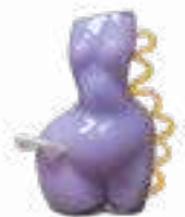
Art.Nr.: FAVWS 31x22x16cm