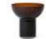
Art.Nr.: PGMBN Ø5,5cm I10,5cm