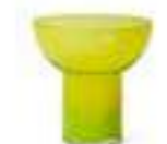
Art.Nr.: PGMGN Ø5,5cm I10,5cm