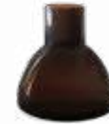
Art.Nr.: PCMBN Ø18cm I18,3cm