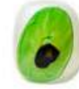
Art.Nr.: EVBGN ~ Ø25cm ~ I28cm