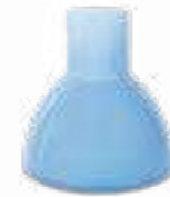
Art.Nr.: PCMBE Ø18cm I18,3cm