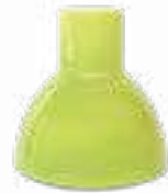
Art.Nr.: PCMGN Ø18cm I18,3cm