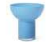
Art.Nr.: PGMOLB Ø5,5cm I10,5cm