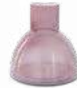
Art.Nr.: PCMAE Ø18cm I18,3cm