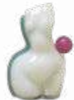
Art.Nr.: FAVAR 31x22x16cm