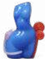
Art.Nr.: FAVSR 31x22x16cm