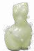
Art.Nr.: FAVCDL 31x22x16cm