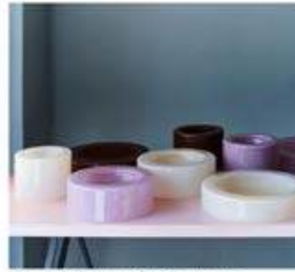
By the Editor at Large