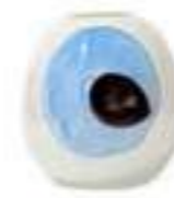
Art.Nr.: EVBBE ~ Ø25cm ~ I28cm