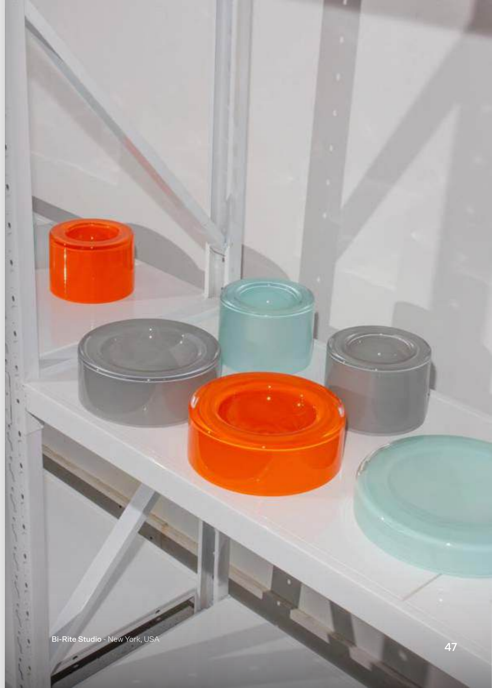
Bi-Rite Studio - New York, USA

Ursula Futura objects are available in more than 40 carefully selected stores worldwide. From independent concept stores to renowned department stores, each partner curates our pieces as part of a distinctive design dialogue. This growing network reflects the diversity of the Ursula Futura universe while ensuring our objects are discovered in spaces that share the same sense of quality, creativity, and wonder.